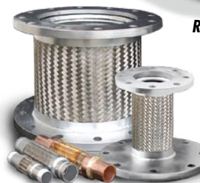
Flexible Metal Hose