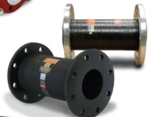
Rubber Pipe Connectors