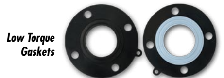
Low Torque Gaskets