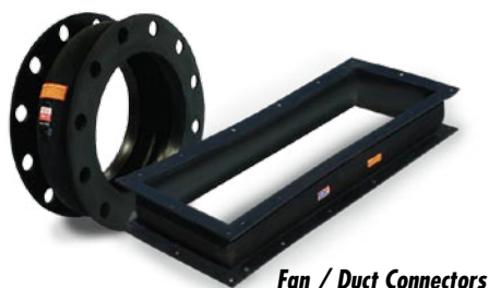
Fan / Duct Connectors