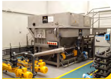
IPF - Compact dissolved air flotation units for low capacities