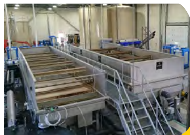
GDF - Open dissolved air flotation units for handling high sludge loadings