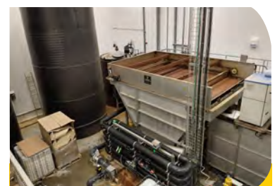
AECO-FAT - DAF is the first step to recover fat from sludge to be used as biofuel