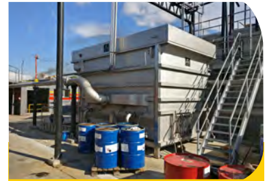
NPF - Compact dissolved air flotation units for high capacities