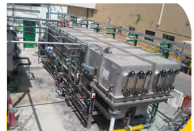
DGF/DNF - Dissolved Gas flotation unit using nitrogen-gas or biogas in the aeration system