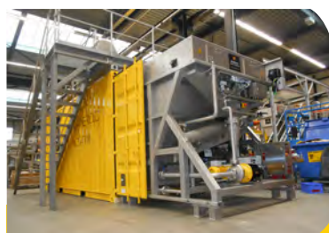
ICFF - Containerized DAF system based on a plug and play principle